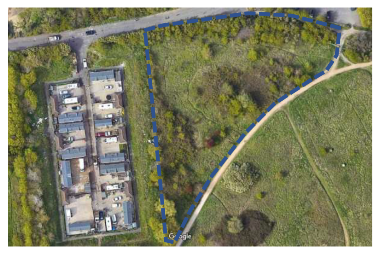
Image of existing site which is in need of refurbishment. Existing hardstanding holds water and will require replacement.

Exiting site and land proposed for expansion. This will utilise existing soft landscape screening through retention of trees and shrubbery on boundary.